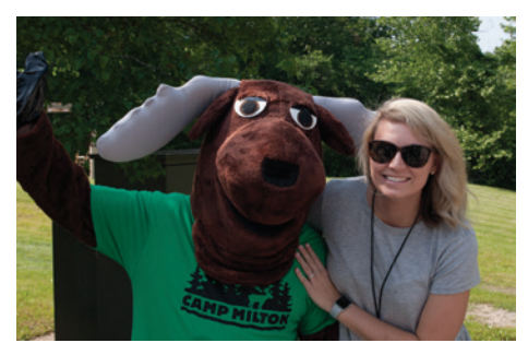
Milton truly came to life June of 2019 when our life-size Milton costume was donated.